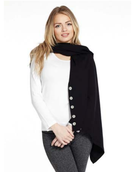
The Très Chic