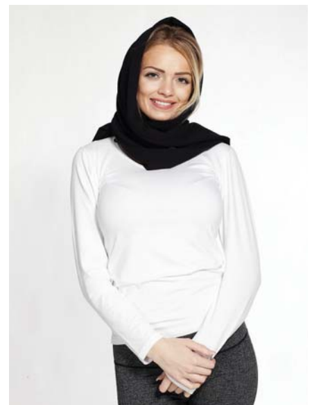
The Jackie O